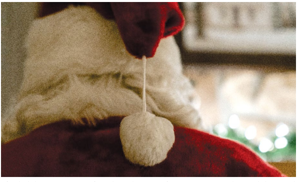
This holiday season, Santa's making the most of energy savings in his workshop, and you can too!

on using cordless power tools with the ENERGY STAR* rating. According to energystar.gov, if all power tools in the U.S. used ENERGY STAR*-rated battery chargers, 2 billion kWh hours of electricity could be saved—that's equivalent to reducing